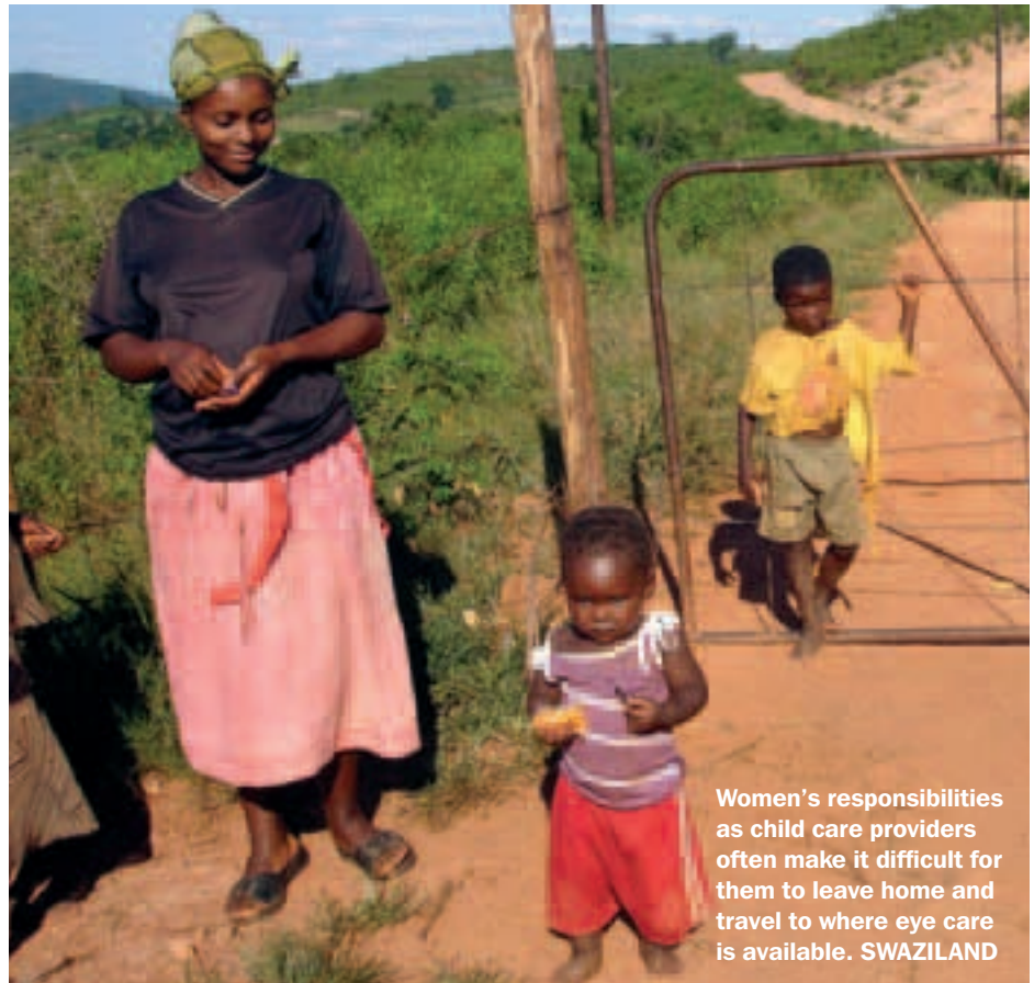
Women's responsibilities as child care providers often make it difficult for them to leave home and travel to where eye care is available. SWAZILAND

The journal is produced in collaboration with the World Health Organization. Signed articles are the responsibility of the named authors alone and do not necessarily reflect the policies of the World Health Organization. The World Health Organization does not warrant that the information contained in this publication is complete and correct and shall not be liable for any damages incurred as a result of its use. The mention of specific companies or of certain manufacturers' products does not imply that they are endorsed or recommended by the World Health Organization in preference to others of a similar nature that are not mentioned.