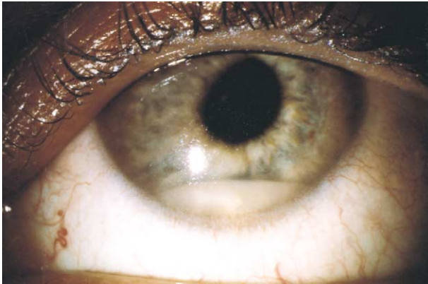
Fig. 1. Pseudohypopyon due to intraocular lymphoma.